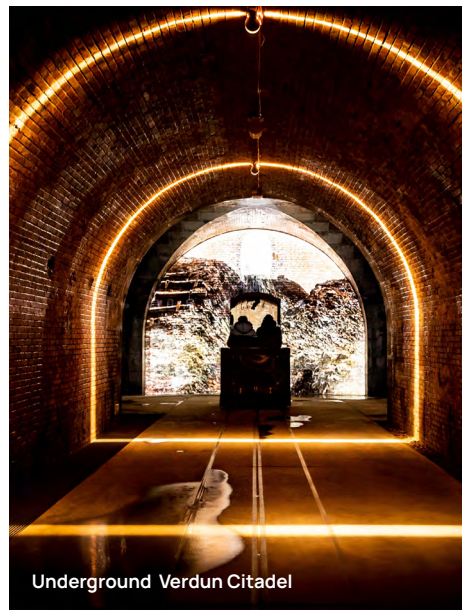
Underground Verdun Citadel