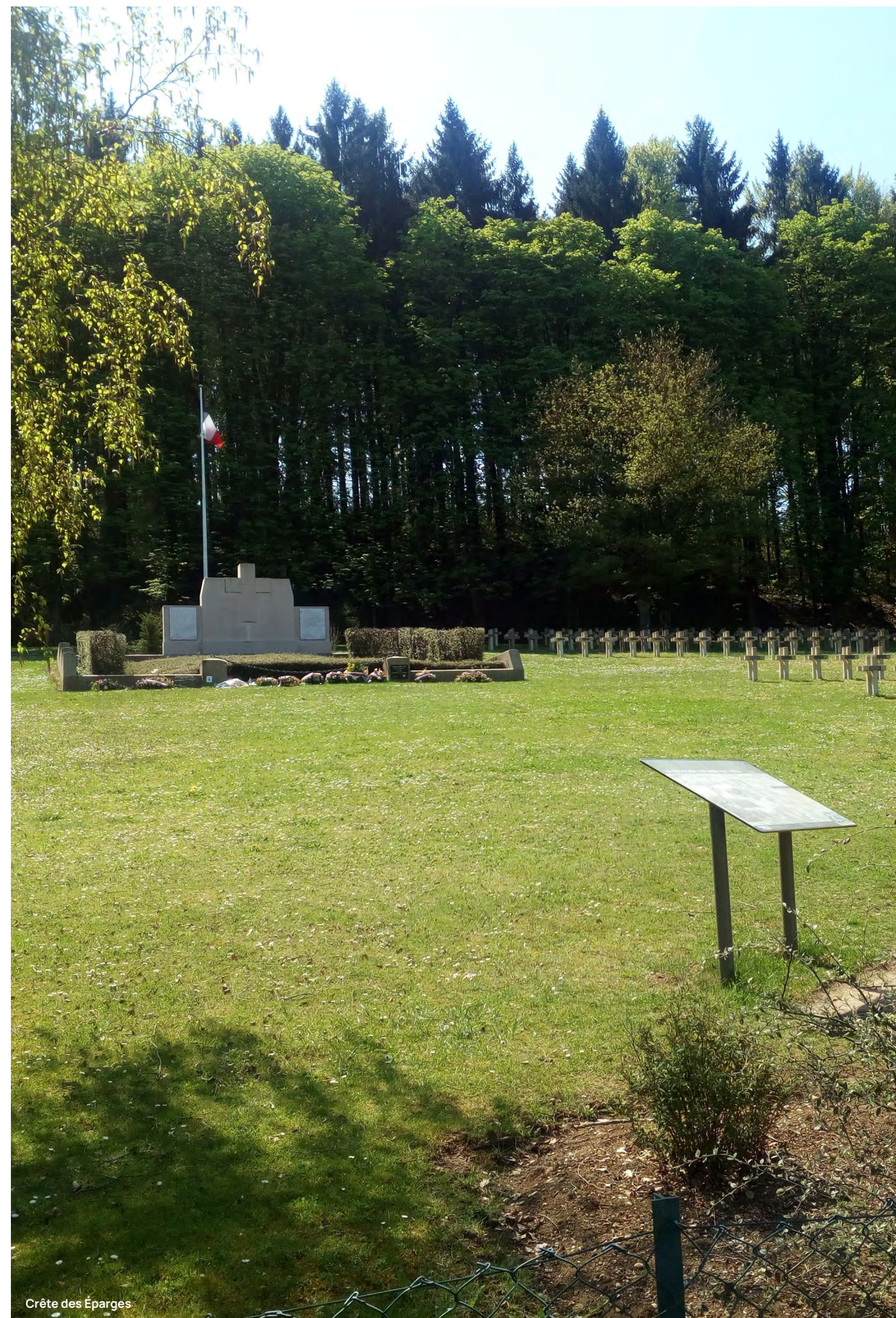
Crête des Éparges

To learn more, go to the remembrance stone of the village of Fleury-devant-Douaumont and to the Douaumont Ossuary , where you can read a condemned soldier's last letter to his wife.