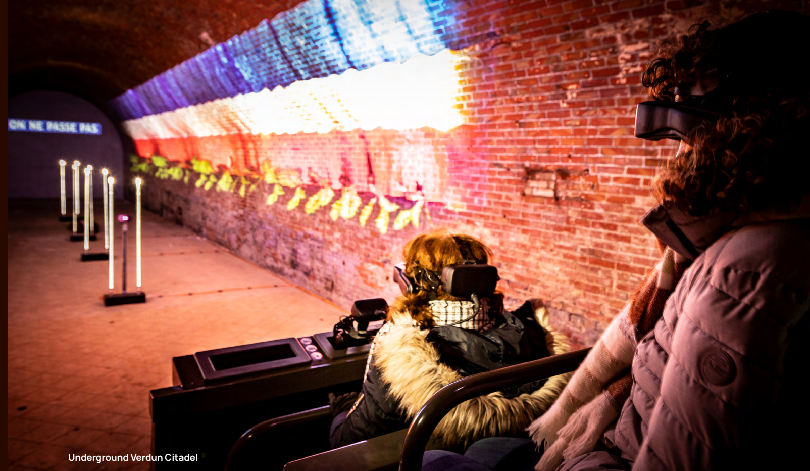
Underground Verdun Citadel