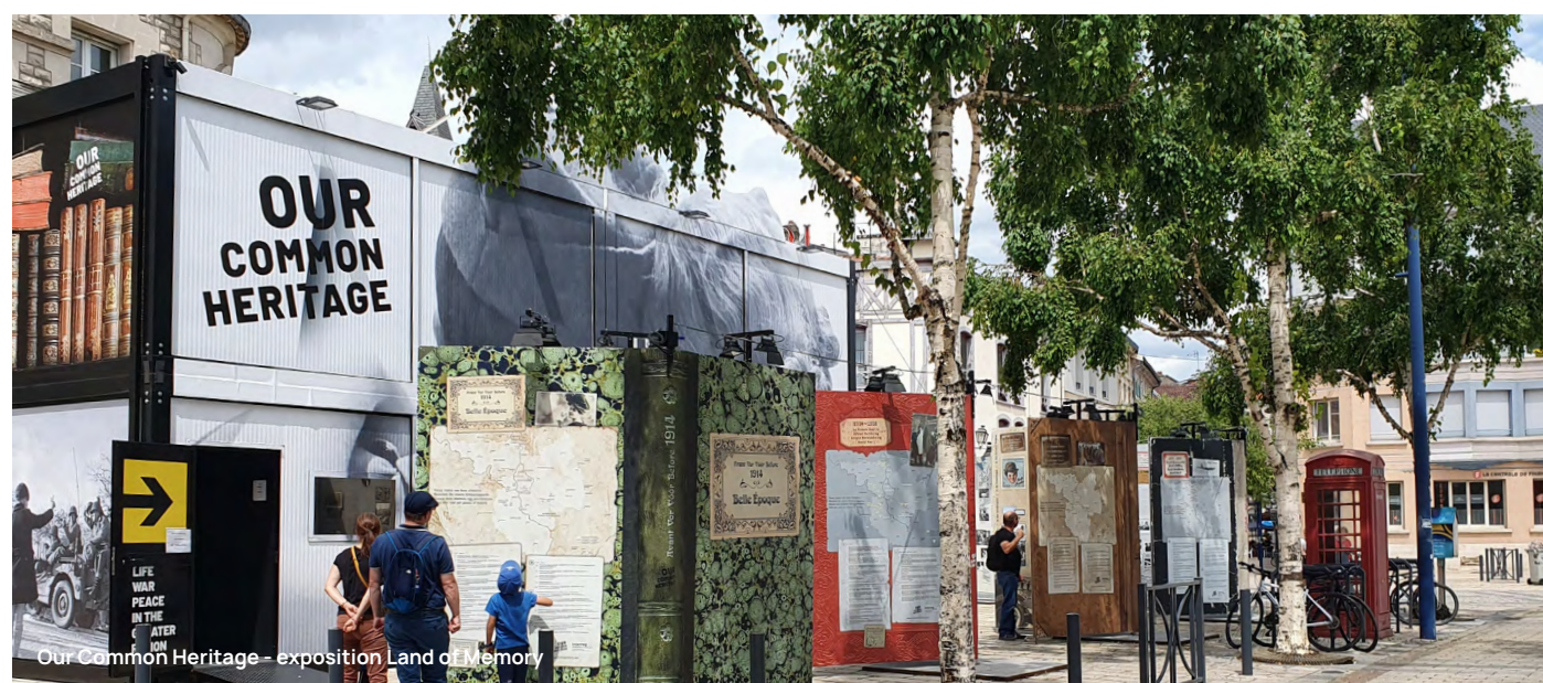
Our Common Heritage - exposition Land of Memory

A website presents the exhibition's dates and locations. The public can submit their own photos of the period for possible inclusion in the exhibition. > See the agenda