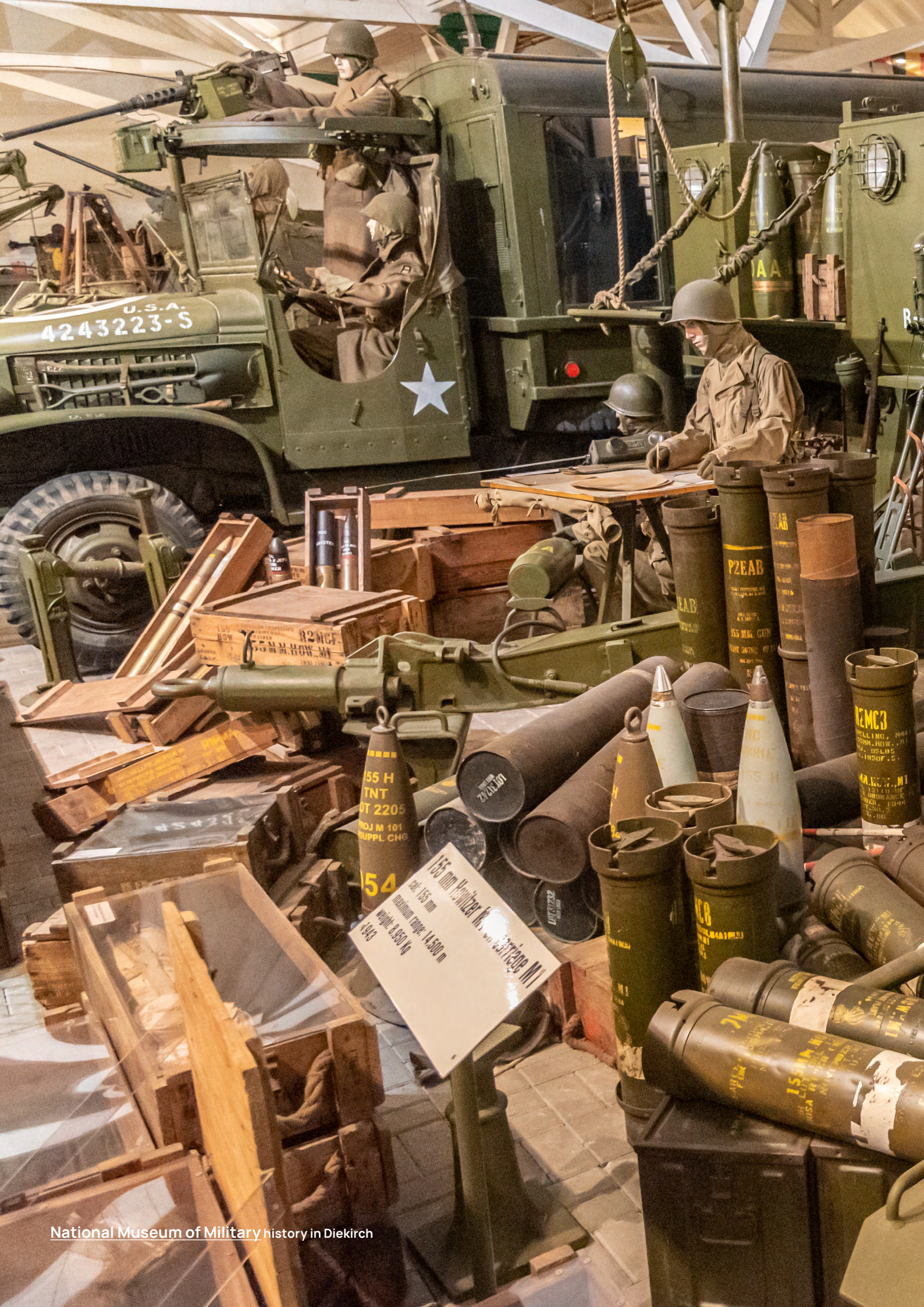
National Museum of Military history in Diekirch