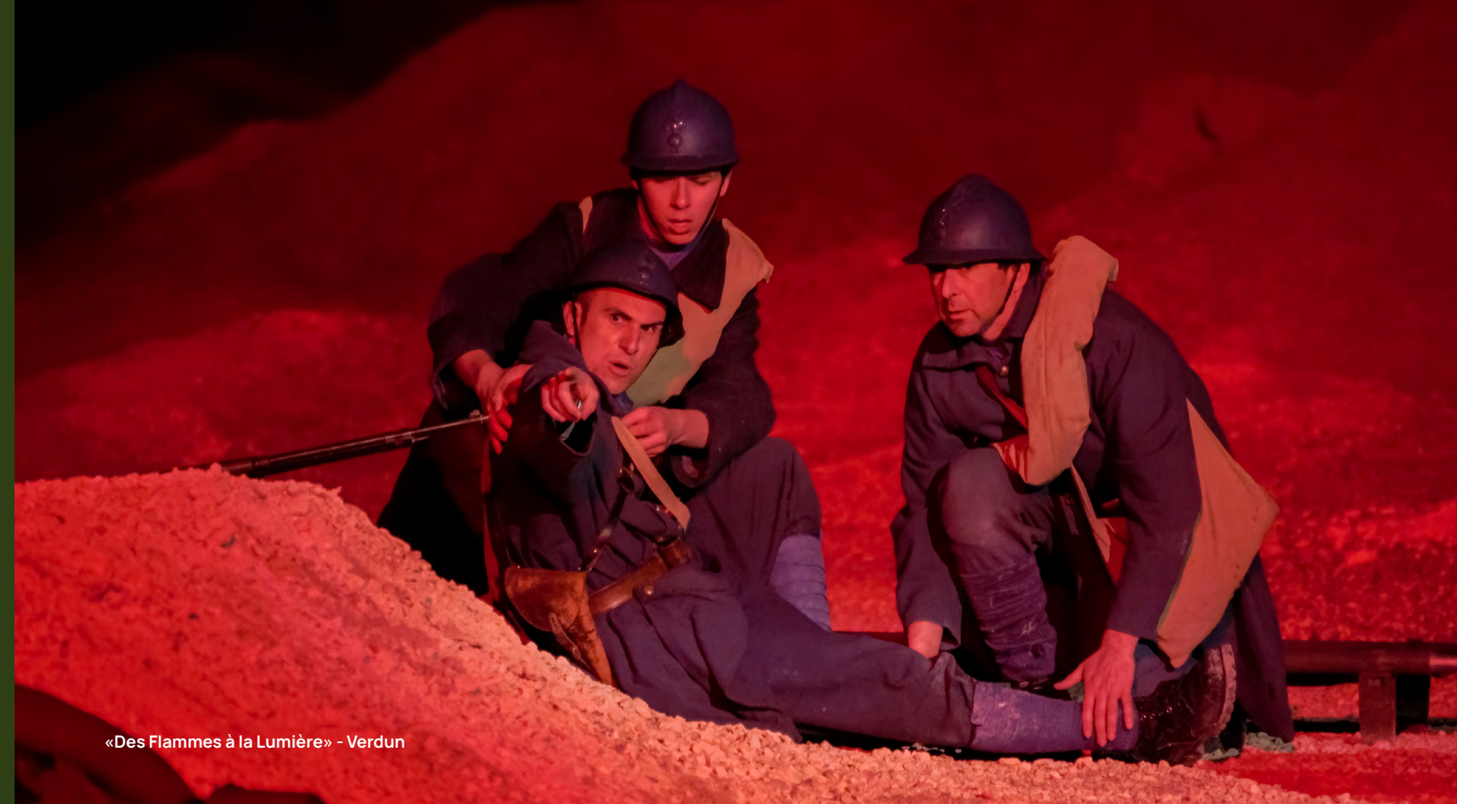
«Des Flammes à la Lumière» - Verdun

Because the region is vast, it is possible to spend several days as part of a remembrance and educational excursion encompassing emblematic sites, learning opportunities and nature walks.