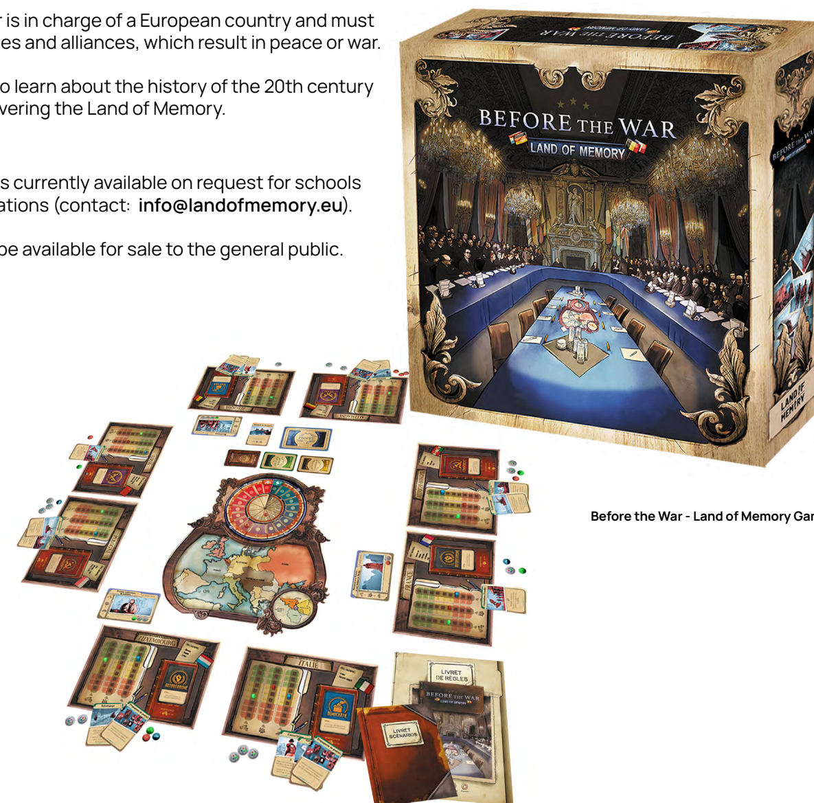
Before the War - Land of Memory Game

It will soon be available for sale to the general public.