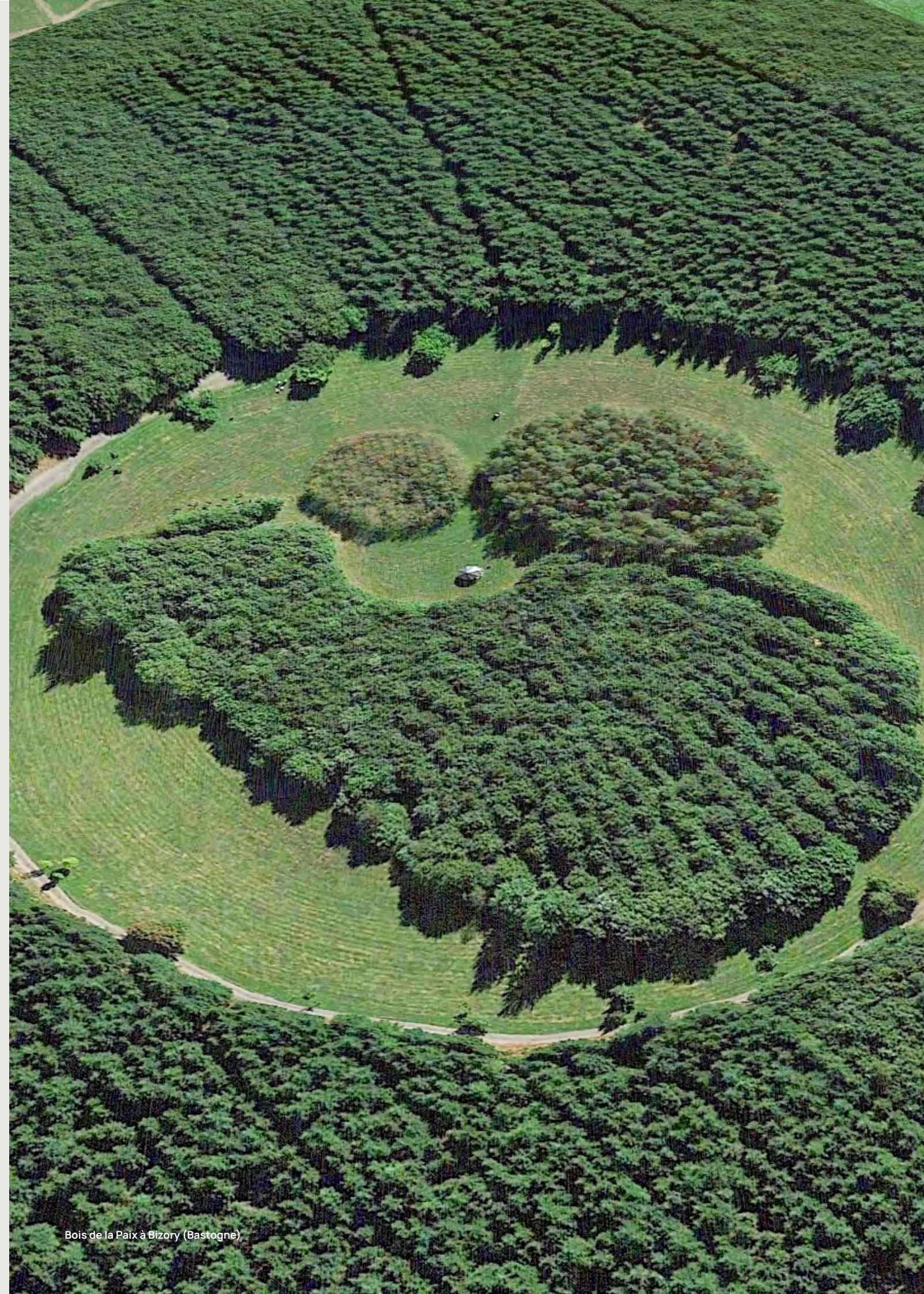
Bois de la Paix à Bizory (Bastogne)

This cross-border region was strategic during the world wars and witnessed major historical events, thus it is a rare place that is imbued with emotion and where there is much to learn.