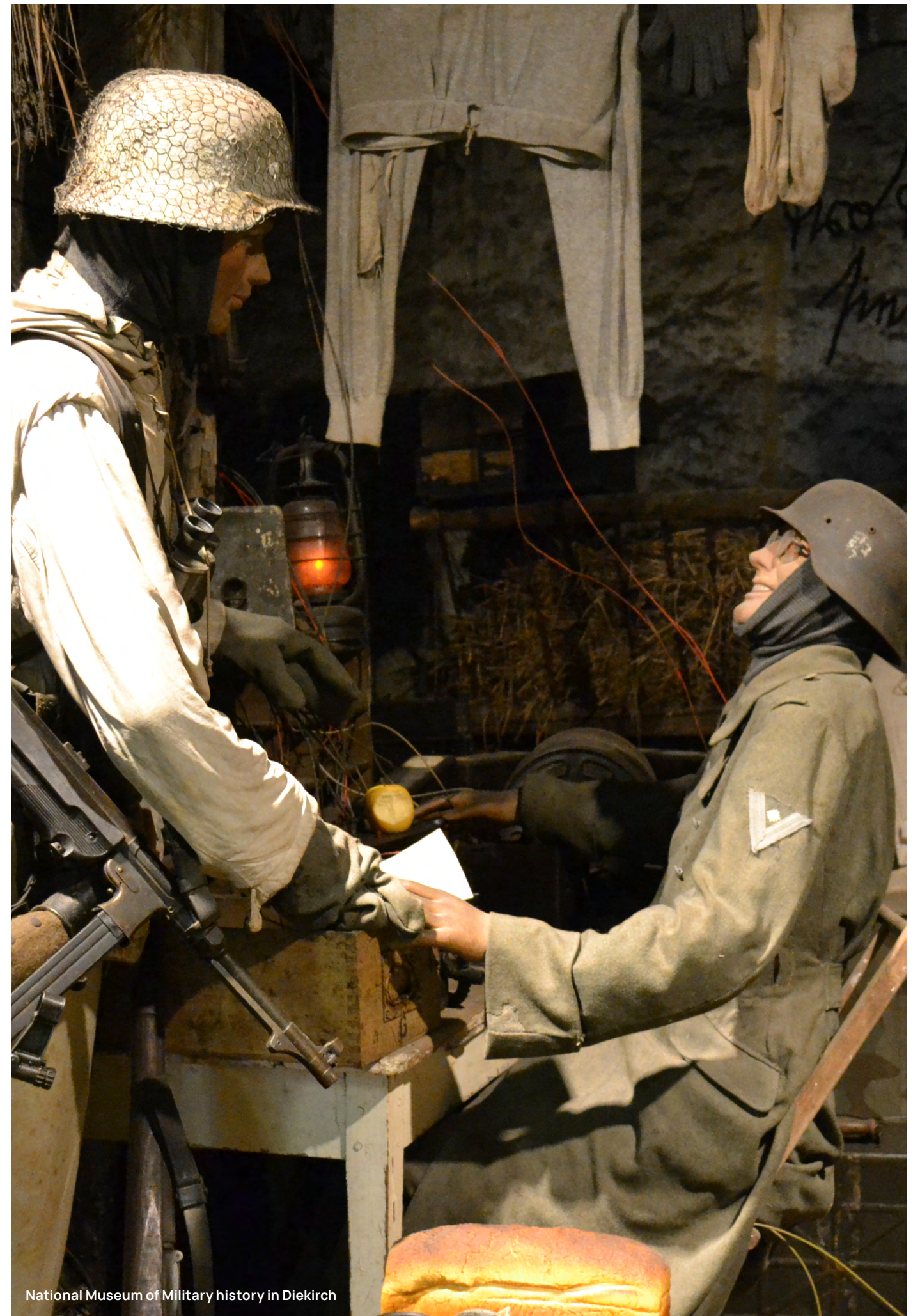
National Museum of Military history in Diekirch