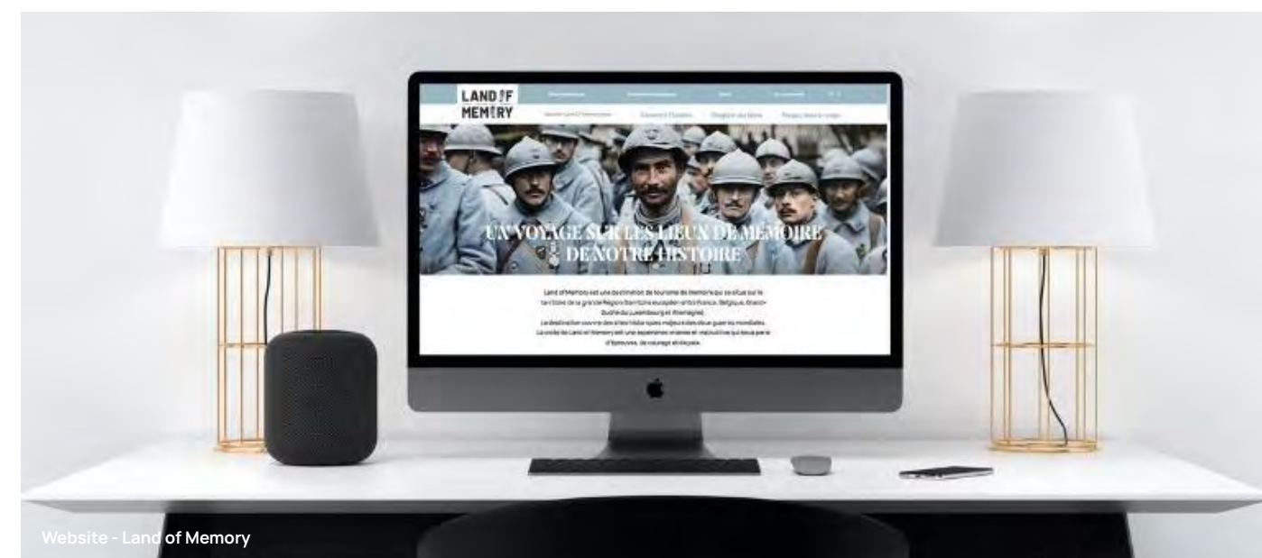
Website - Land of Memory