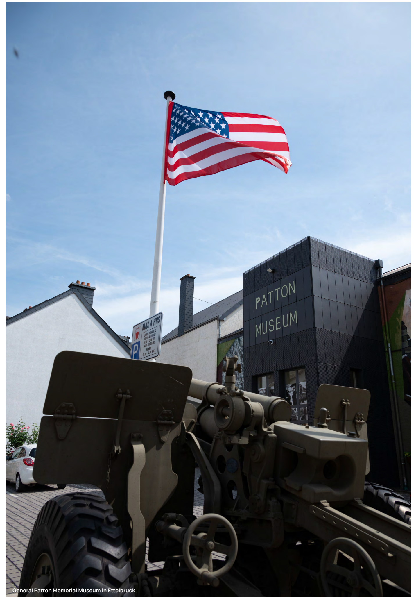
General Patton Memorial Museum in Ettelbruck