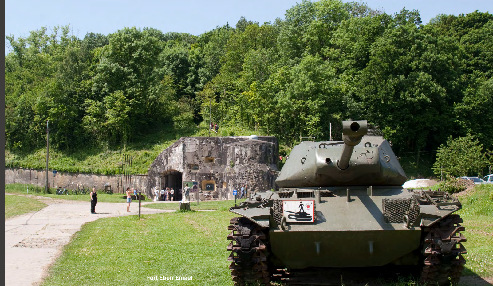
Fort Eben Emael

Why not learn history in a different way?