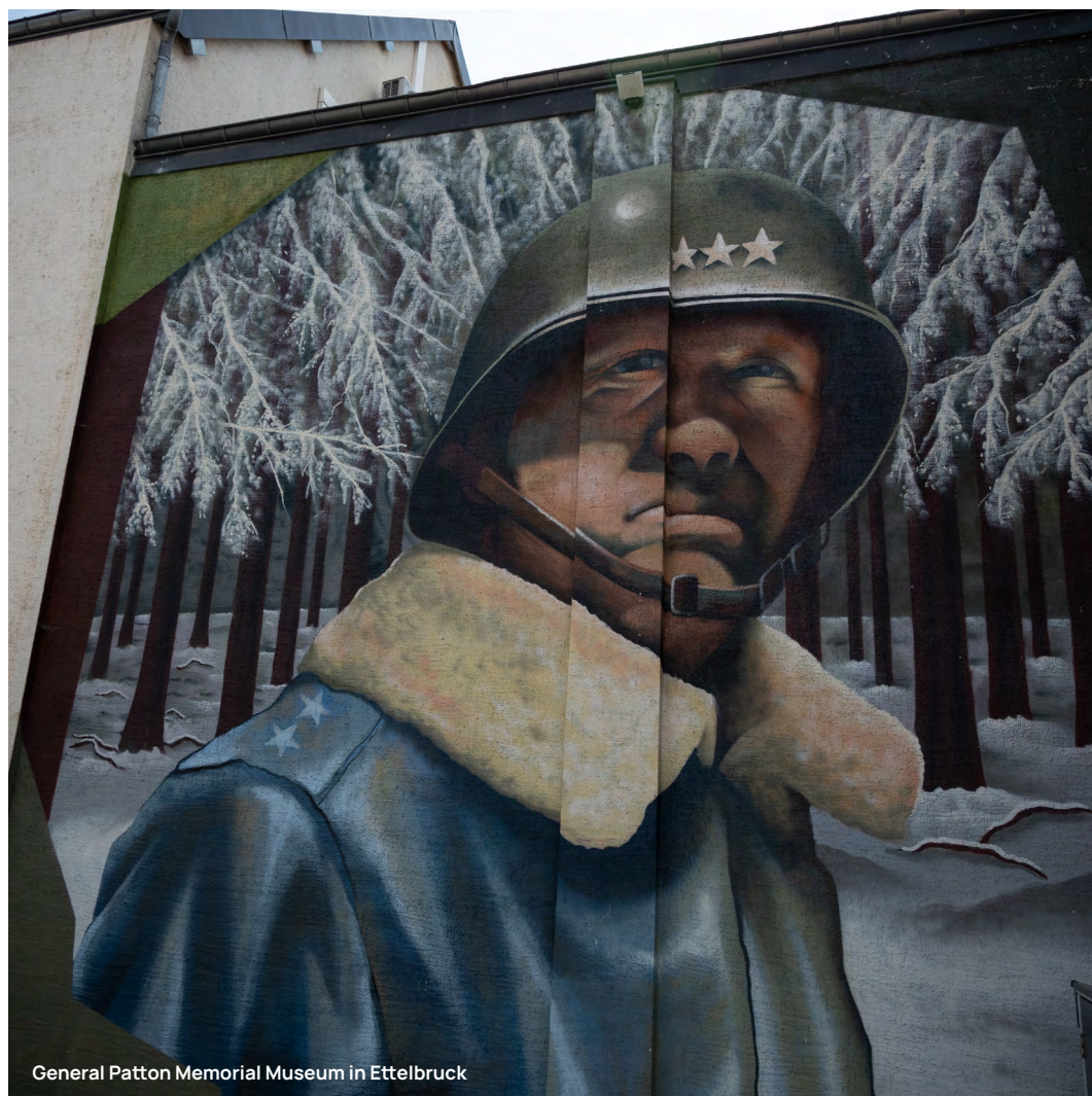
General Patton Memorial Museum in Ettelbruck

Bastogne and its many museums as well as the Luxembourg American Cemetery and Memorial pay tribute to the soldiers of the 101st Airborne Division, whom Patton rescued from a German trap during the winter of 1944-45.